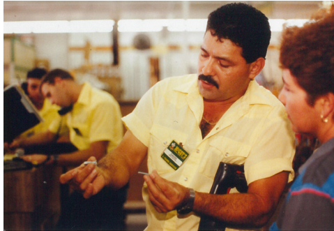
Photo: McCoy's Inside Sales Staff assisting customers.

At the top of the list were changes to its business plan and culture. The company's core focus was re-examined, and it was decided that leadership development would play a prominent role moving forward. In the mid 90s, McCoy's adopted a new philosophy to "Grow Self, Grow Others, and Grow The Business" in that order, incorporating the sentiment into its mission statement.