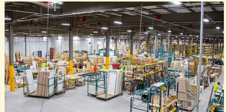
Photo: Inside the new McCoy's Millwork facility in New Braunfels, TX.

The company's Door and Millwork facility in New Braunfels, TX moved into a larger facility with state-of-the-art manufacturing equipment allowing for a substantial increase in efficiency and production capacity. The facility produces custom and standard interior and exterior door units for builder and remodeler customers for the majority of McCoy retail locations.