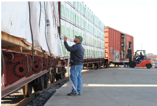
Photo: McCoy's Pharr Re-Load Center

In 2015, McCoy's began operating internal distribution centers and the decision to bring estimating in house came to fruition with the establishment of McCoy's Estimating and Strategic Accounts Departments. The company developed a comprehensive 18-month management training program in 2016 and continues to add product lines.