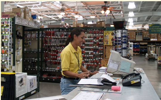
Photo: McCoy's store interior 2003

Although new stores were stocked with twice as many products as older locations, McCoy's total SKU (or stock keeping unit) count was still a far cry from the selection offered by its huge competitors. In response, the company began carrying more professional-grade equipment and contractor-lengths of material in the first decade of 2000, in hopes of attracting and retaining its target audience of Born-To-Build customers. Outside the store, drive-through yards were upgraded and delivery turn times tightened.