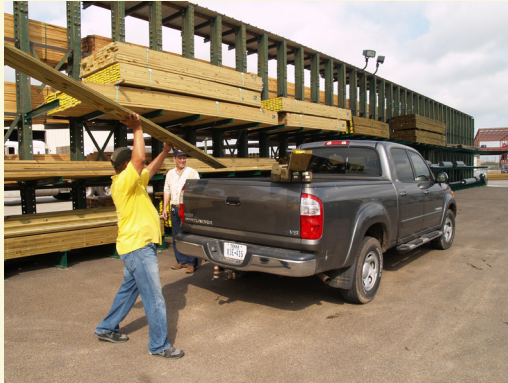
Photo: Loading up a customer in McCoy's drive-thru lumberyard.

As a way to position itself as a company focused on customer service, McCoy's developed a "Business as UnUsual" training strategy, teaching that customers need respect and appreciation as well as fair pricing and products they can count on. Note: Cataloged as Legacy Leadership since 2016, this philosophy is currently taught at the McCoy College of Business at Texas State University in San Marcos, Texas.