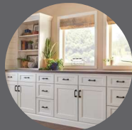
Kitchen & Bath

Find us on Instagram @ wolfhomeproducts for inspiration on your next project!